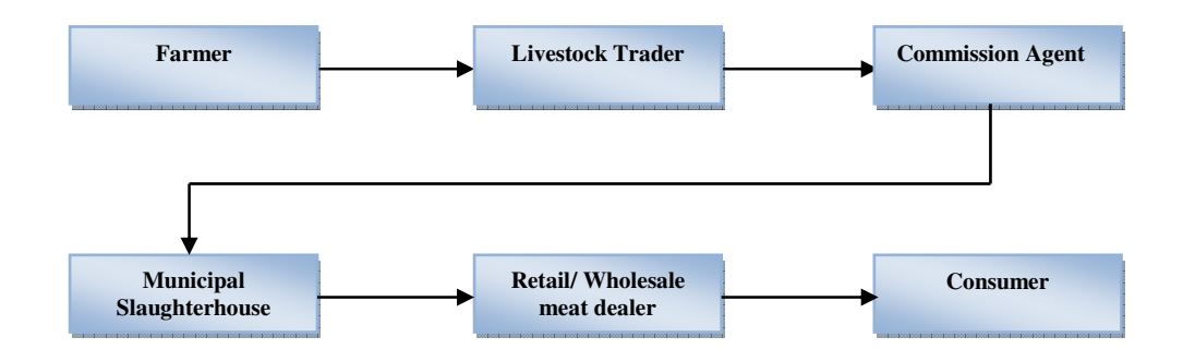
Figure 1: Buffalo meat value chain domestic

Buffalo meat produced in India is primarily raised by dairy farmers. Most farmers sell their animals to traders. Livestock traders don't own slaughter facilities but rather use the services of butchers at municipal slaughterhouses. The buffalo meat is then collected by wholesale meat dealers or in some instances directly by retailers. This chapter sheds light on the roles and responsibilities of various actors as the product moves from farm to consumers and also various stages in the value chain and the economics involved in each stage.